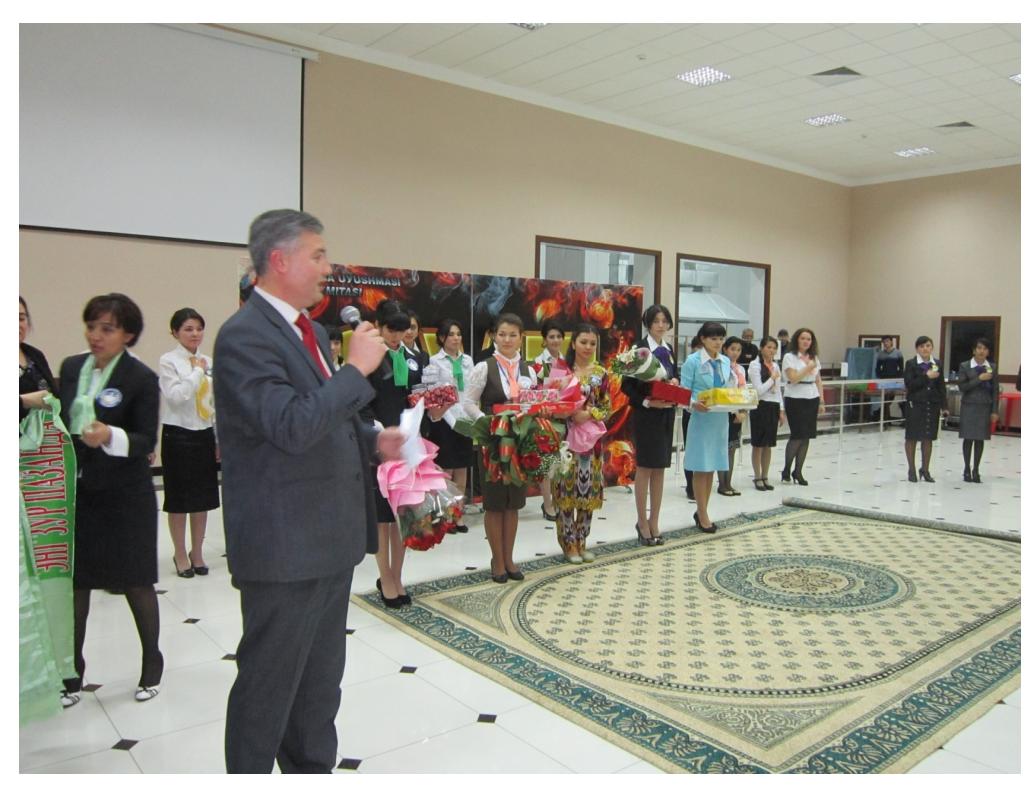
The 1st of October - Teachers` Day