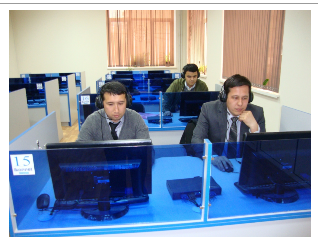
The process of training