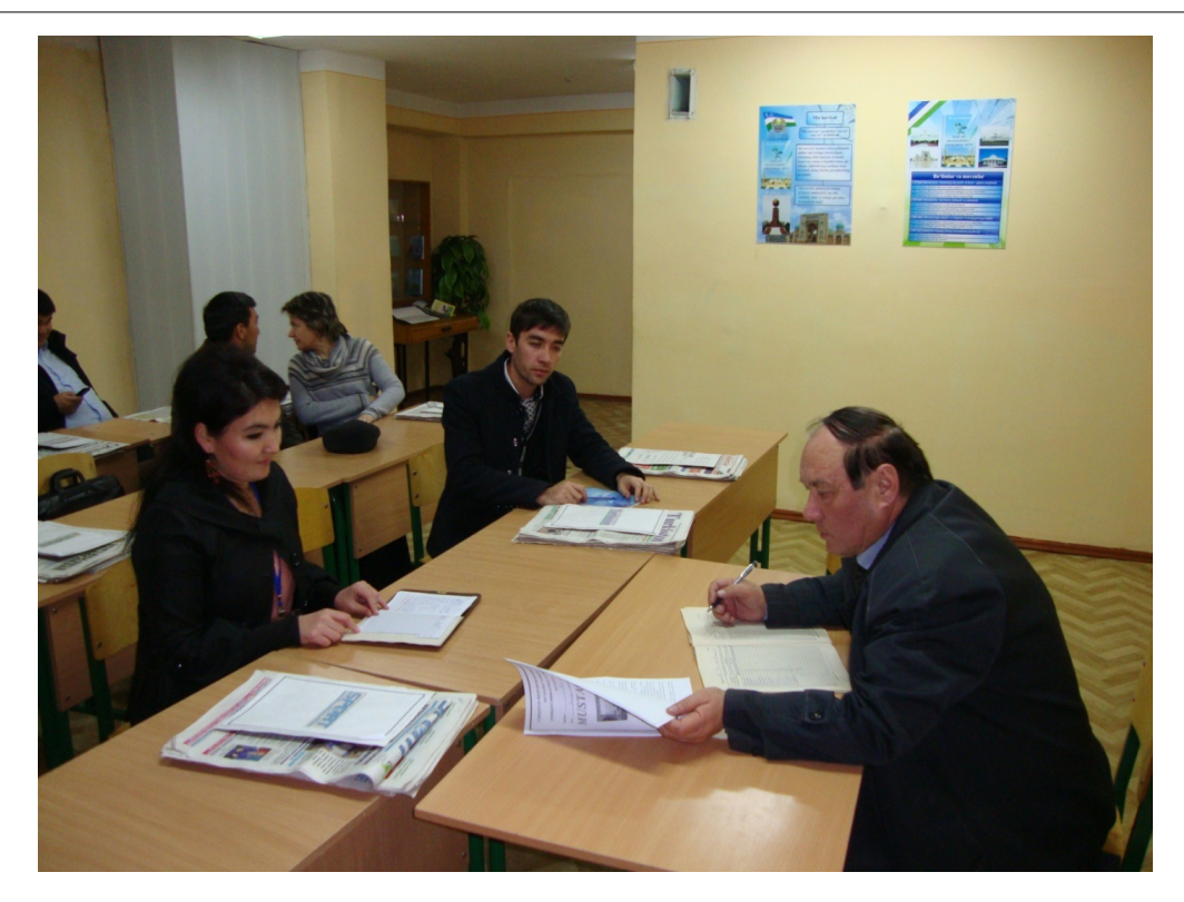
The operation of the system "Teacher-Disciple" in the teaching process